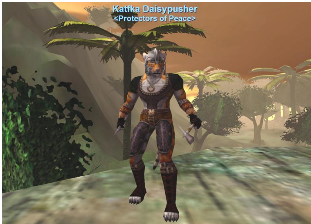
Figure 4. Character showing guild tag.

Ultimately the guild tag comes to signal a reputation above and beyond any individual player. It acts as a social signifier and locates the character in a larger system of reputations, affiliations, favours, and even grievances. Guilds themselves recognize this and often require members to always keep the tag that shows a player’s guild affiliation visible (see figure 4).