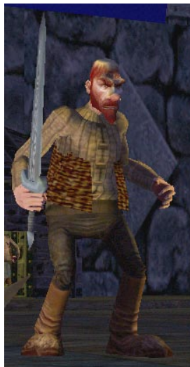
Figure 1: A giant with a (huge) sword.

Whenever a monster is killed, any member of the group that killed it can ‘loot’ the corpse. Sometimes the looting results in a money reward, sometimes the corpse holds items that the looter can take possession of. The money from the monster can be automatically divided between the characters in the group but items are not as easily shared. Group members have to agree on a looting scheme and then trust everyone to stick to it. These schemes range all the way from casual (free) looting to fairly complicated procedures and rules.